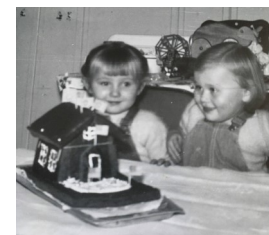
Anyone recognize these youngsters at a birthday party??*